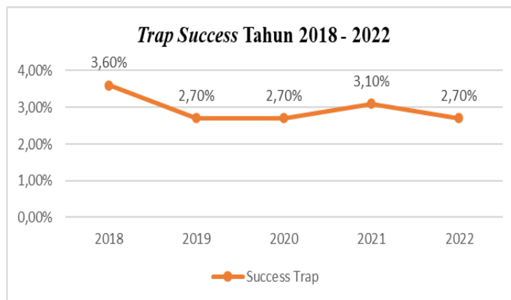
Fig. 1. Trap Success 2018 - 2022

Based on the table, it shows that the calculation of trap success for five years by BBTCLPP Surabaya in Pasuruan Regency was the highest in 2018.